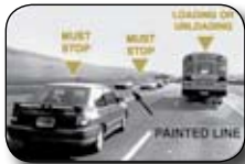
You MUST STOP on roadways with painted lines.