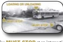
You MUST STOP at an intersection, whether it is or is not marked with a stop sign. All traffic MUST STOP .