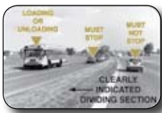
Clearly indicated dividing sections include trees or shrubs, rocks or boulders, a stream, grass, etc.