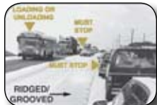
You MUST STOP on roadways with ridged/grooved dividers.