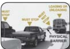
Physical barriers include concrete median barriers, metal median barriers, guide rails, etc.